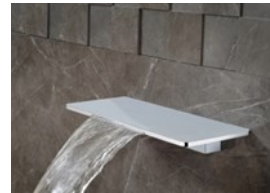
Fineline Bath Spout